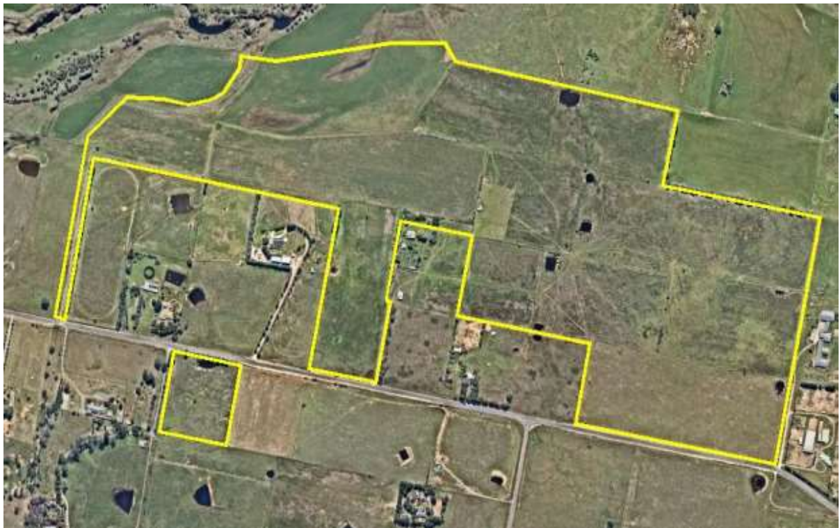
Figure 1: The subject land area that is proposed to be rezoned to R5 Large Lot Residential comprises 63.37ha.